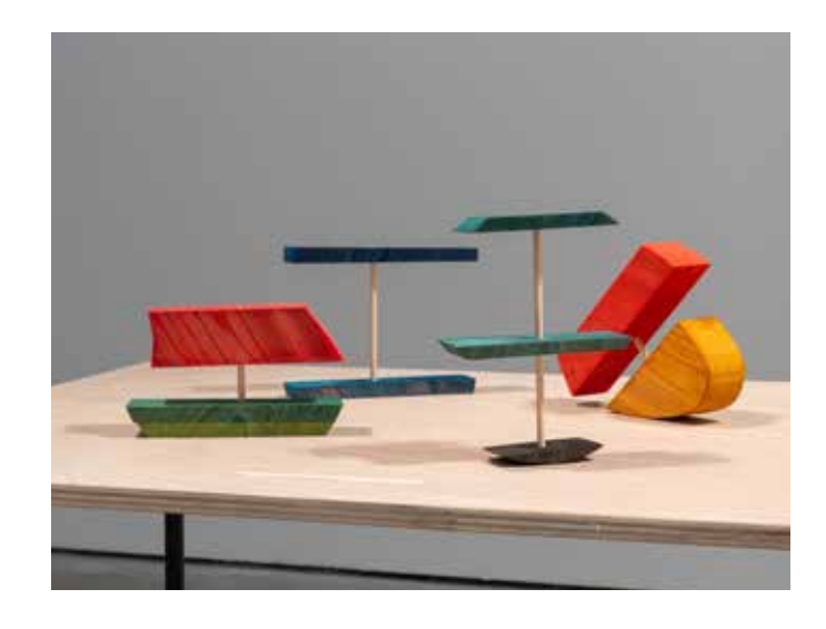
Sales Volume of the 10 Top Meat Processing Companies, 2019, wood and ink, 44 \times 36 \times 25 cm.

This series of small wooden sculptures enlists colourful geometric constructions to explore the economic, financial, and ecological processes at play in North American food and biofuel production by materializing graphical representations.